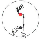
Surface Location Detail Not to Scale

NOTE: 1) Plane Coordinates shown hereon are Lambert Grid and Conform to the "Texas Coordinate System", Texas North Central Zone, North American Datum of 1927, unless otherwise noted. 2) Geodetic Coordinates shown hereon reference the North American Datum of 1927, unless otherwise noted. 3) Elevations shown hereon reference the National Geodetic Vertical Datum on 1929, unless otherwise noted. 4) Unit, tract and acreage provided by client. 5) This plat is provided only for filing purposes with the Texas Railroad Commission and should not be construed as a boundary survey.